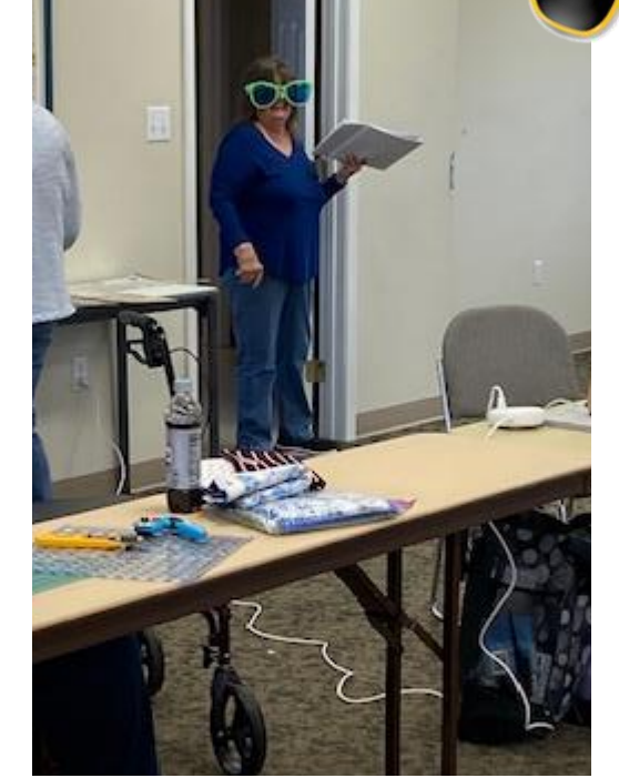
Who needed these copies?

Be sure to send us your pictures of club activities! You can email those to Ronda at: <a href="mailto:rrex@uky.edu">rrex@uky.edu</a>