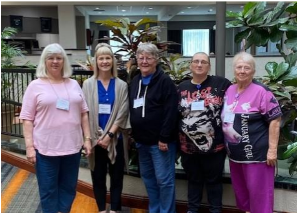
Our Gallatin Homemakers attendees at the KEHA State meeting held at Bowling Green, KY on May 7-9th.