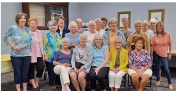
The Cross County Homemakers had a great group at their May meeting!