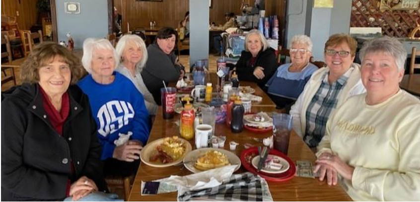
Members of the Back to Basics club enjoyed lunch in Carrollton at Welch's Restaurant in March.